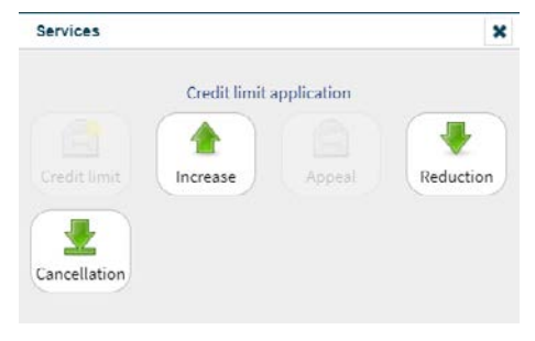
Services available for selected Buyer

For a previous restrictive limit granted, you can appeal the decision as well and eventually provide additional information to the Underwritter who will review your appeal request.